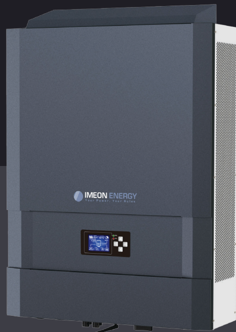
IMEON 9.12 Up to 12kWp Three phase